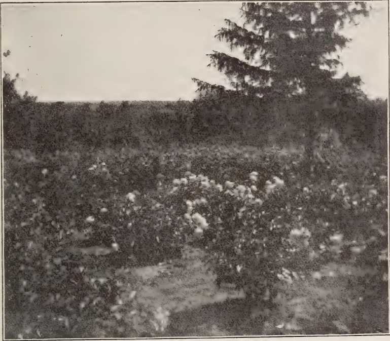
The cut between pages 26-27 shows a small bed of Paenonies on the grounds of Brand & Son taken after 40 dozen had been cut the same day. The view on this page was taken in 1899, Faribault, Minnesota.